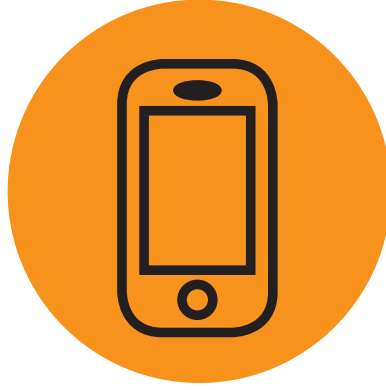
A FRIENDLY CHAT!

If you are in need of support or know anyone who is PLEASE GET IN TOUCH