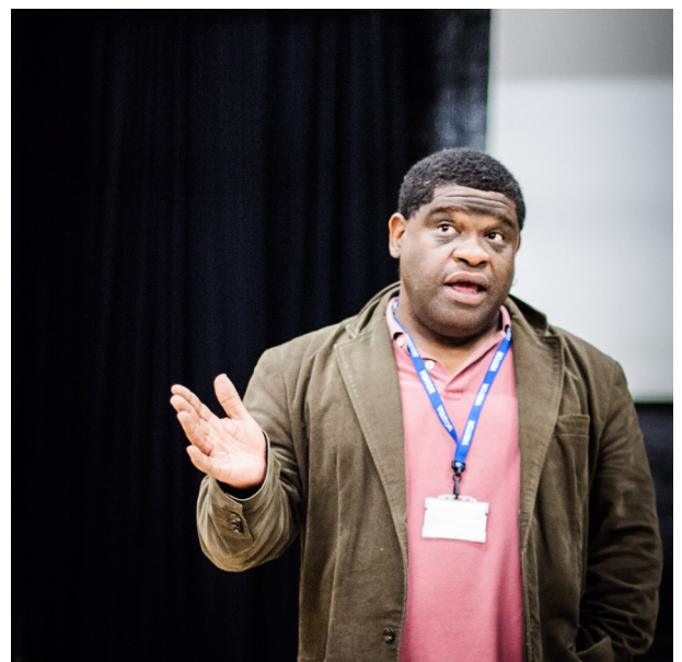
Journalist Gary Younge speaking to students

Enrichment is an important part of the sixth form experience. These activities are vital for students' personal development and progression to university and employment. We offer a wide range of enrichment activities, both linked to lessons and beyond the curriculum. These take the form of timetabled classes of lectures delivered by teachers and experts from outside school, sporting activities and teams (using the excellent sporting facilities), language classes, drama performances, Duke of Edinburgh Awards and debating clubs; as well as the two-yearly art and photography trips to New York and the science trip to CERN .