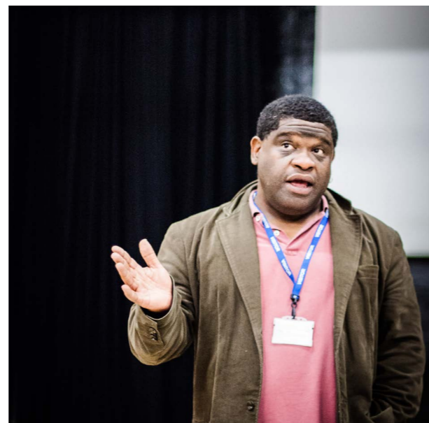
Journalist Gary Younge speaking to students

Enrichment is an important part of the sixth form experience. These activities are vital for students' personal development and progression to university and employment. We offer a wide range of enrichment activities, both linked to lessons and beyond the curriculum. These take the form of timetabled classes of lectures delivered by teachers and experts from outside school, sporting activities and teams (using the excellent sporting facilities), language classes, drama performances, Duke of Edinburgh Awards and debating clubs; as well as the two-yearly art and photography trips to New York and the science trip to CERN .