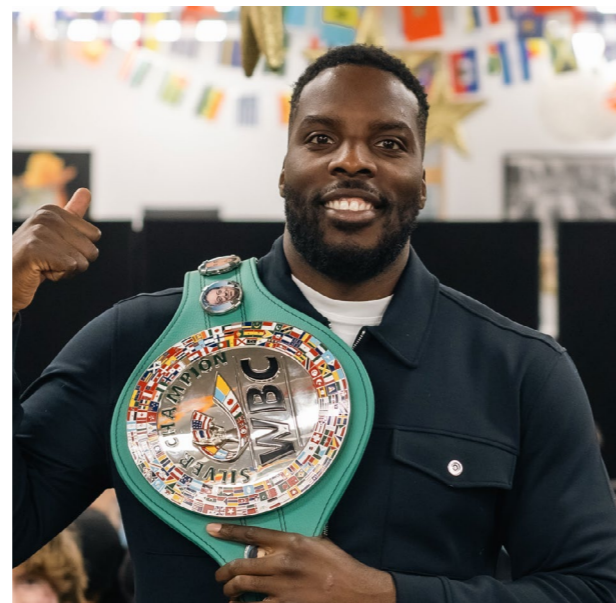
Professional boxer and former SNS student, Lawrence Okolie, speaking to students.

Enrichment is an important part of the sixth form experience. These activities are vital for students' personal development and progression to university and employment. We offer a wide range of enrichment activities, both linked to lessons and beyond the curriculum. These take the form of timetabled classes of lectures delivered by teachers and experts from outside school, sporting activities and teams (using the excellent sporting facilities), language classes, drama performances, Duke of Edinburgh Awards and debating clubs; as well as the two-yearly art and photography trips to New York and the science trip to CERN .