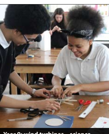
Year 9: wind turbines – science, design and technology