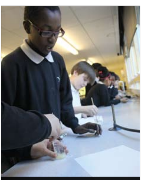
Year 7: spy day - maths, science